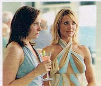
Collette (left) and Diaz shine in Shoes .